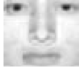
Figure 3: Model image of human face.

get rid of the images which have no face obviously. It can accelerate the matching of face model by using a priori knowledge of luminance and grads. In fact, the sub-image and model used to match is relatively small, about one quarter of the original image, so as to make it robust to the change of scale and rotation of the image and accelerate the matching of face model.