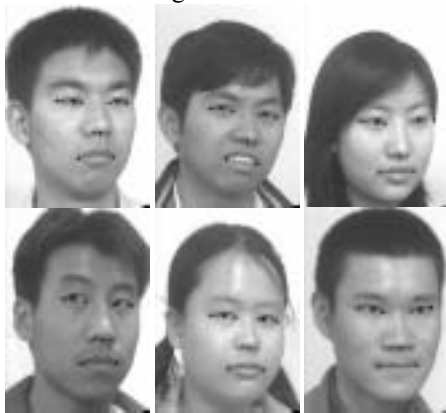
Figure 10: The results of feature points locating on the large-angle rotation faces.

Moreover, for the images in good conditions, this method is relatively robust to the light, expression and wearing glasses, except to the strong sidelight. It will take about 265ms to detect all the feature points in an original face image. Comparing with those presented in the literatures ago [5][8] , the approach proposed in this paper is a feasible and fast method with good accuracy to extract the vital feature points from faces.