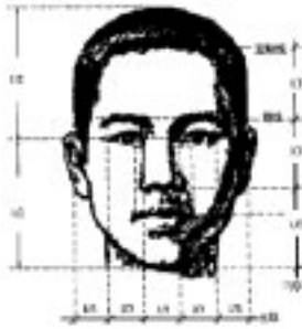
Figure 1: Relationship of face features.

pre-treatment, so as to extend the range of database, reduce the storage and recognize the faces more effectively.