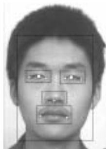
Figure 2: The 9 vital feature points on face.

Additionally, the selection of face feature points is crucial to the face recognition. We should pick up the feature points which represent the most important characteristics on the face and can be extracted easily. The number of the feature points should take enough information and not be too many. If the database has different postures of each people to be recognized, the property of angle invariance of the geometry characteristic is very important. This paper has presented a method to locate the vital feature points of face, which select 9 feature points that have the property of angle invariance, including 2 eyeballs, 4 near and far corners of eyes, the midpoint of nostrils and 2 mouth corners, as shown in Fig.2. According to these, we can get other feature points extended by them and the characteristics of face organs which are related and useful to face recognition.