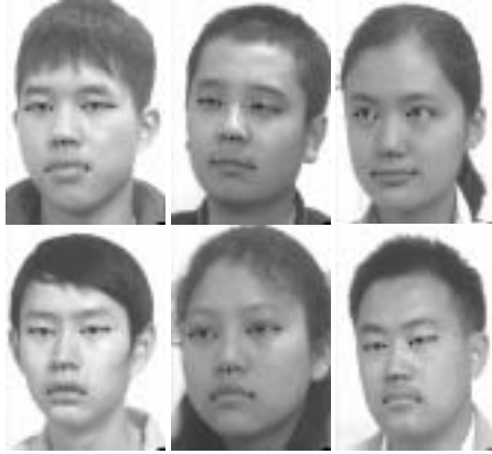
Figure 9: The results of feature points locating on the little angle rotation faces.

as shown in Fig.9, but not very satisfied on the large-angle left and right rotation faces, as shown in Fig.10.