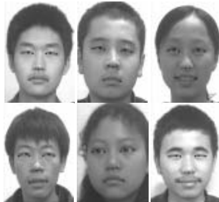
(a) Images in the database of our lab

Notes: A feature point was counted as accurately detected if it was localized to within 5 pixels of the point marked by hand.